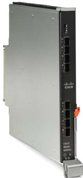
Table 1. Cisco Nexus B22DELL Fabric Extender Model